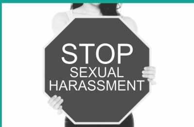
Employee Awareness in Anti-Sexual Harassment